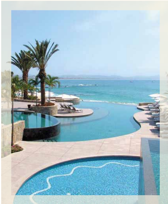
CLUB NINETY SIX