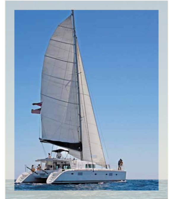
CLUB NINETY SIX CATAMARAN